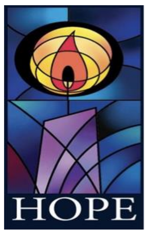
Loving God. Loving People. Growing in Christ Together.