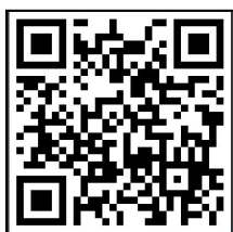
Online Connect Card